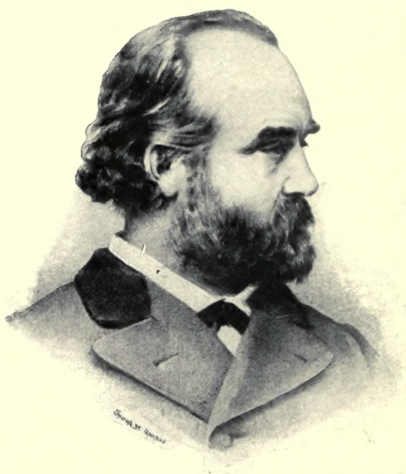
JEAN BAPTISTE ANDRÉ GODIN.